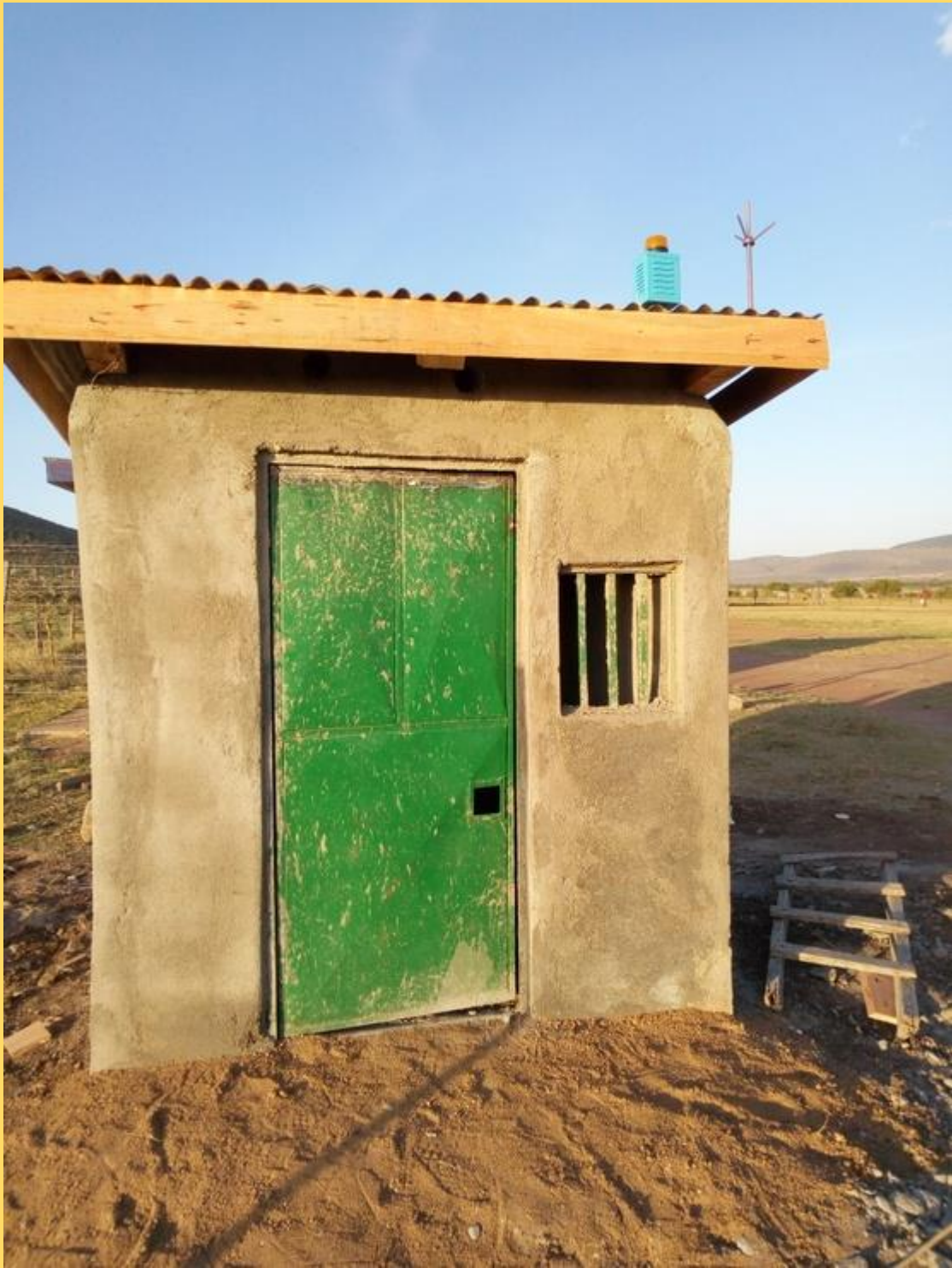
Powerhouse with solar charger inside