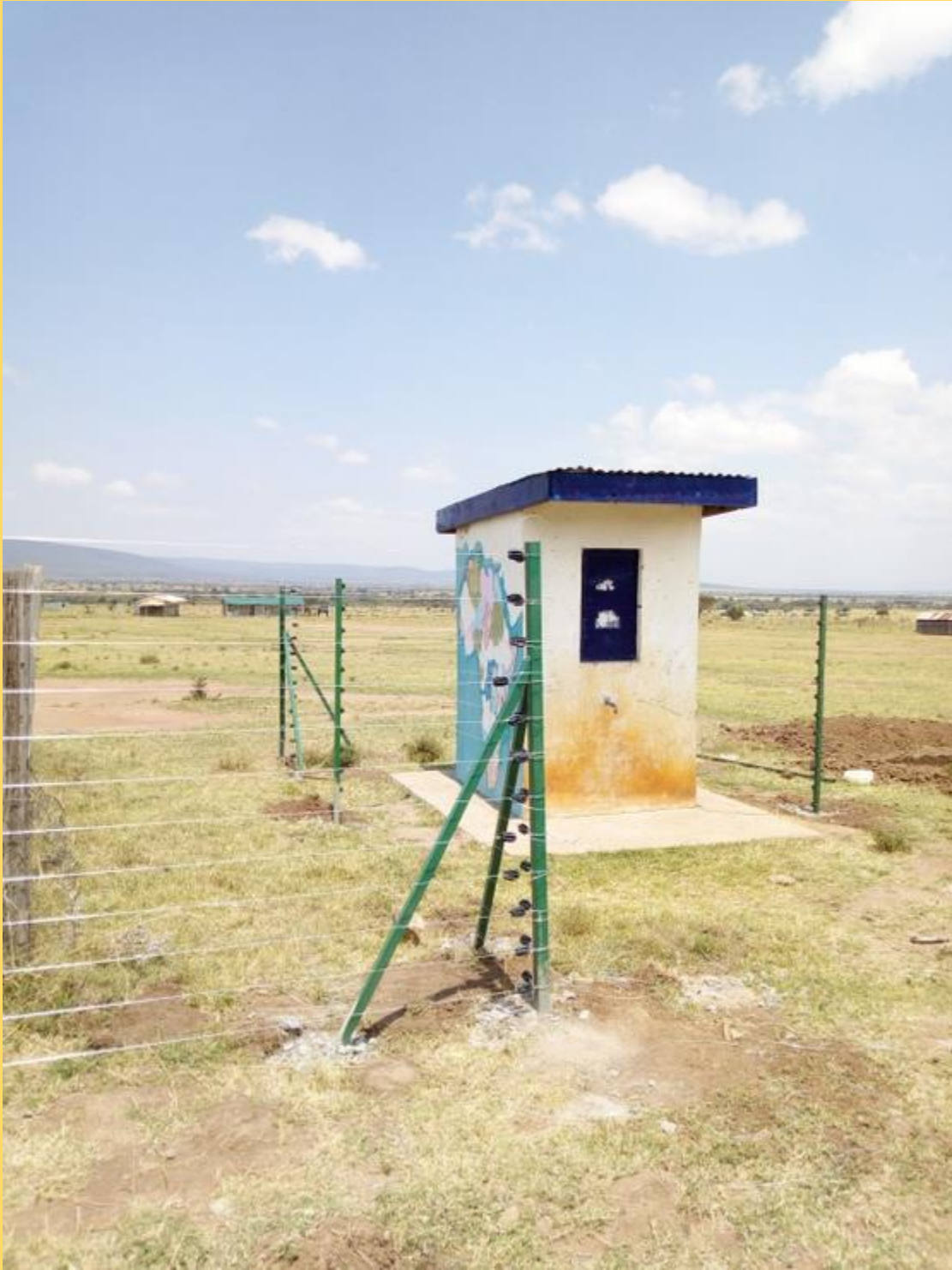
Community Water Point outside the fence