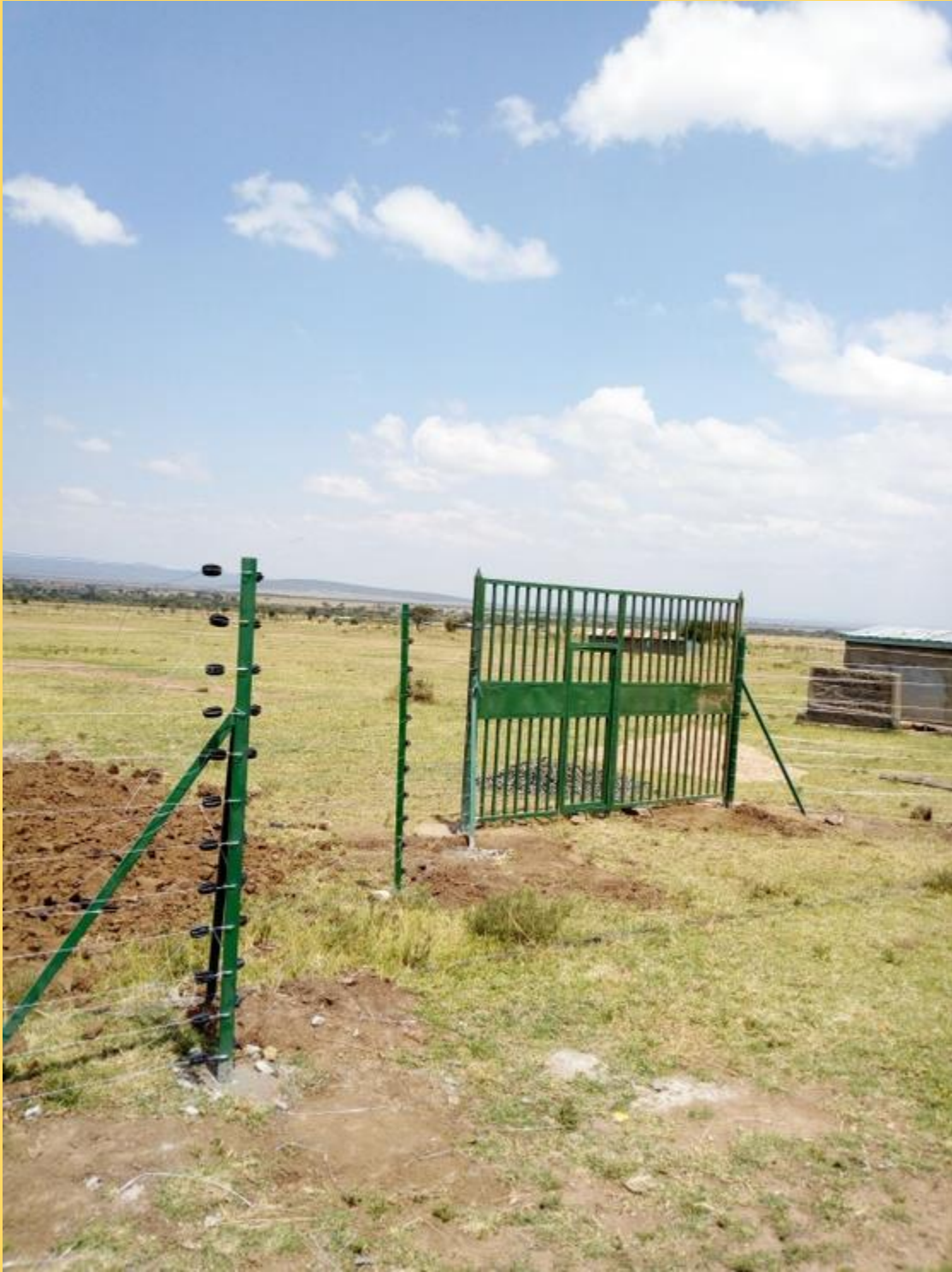
Main gate to get into school yard