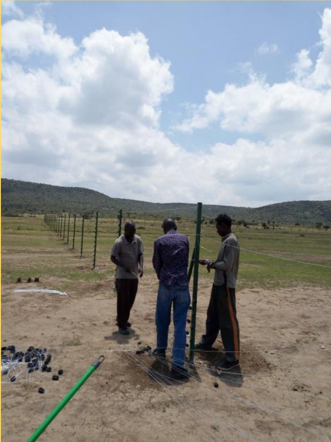
Building the fence