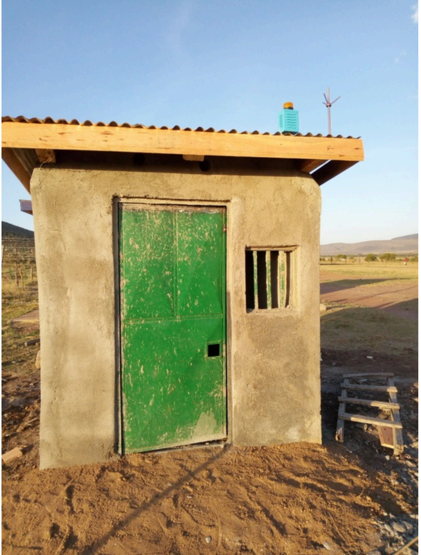
Powerhouse with solar charger inside

We are happy to report that the fencing project, which included a reinforced electric fence surrounding the school and a “power house” which houses the batteries and cables has been completed.