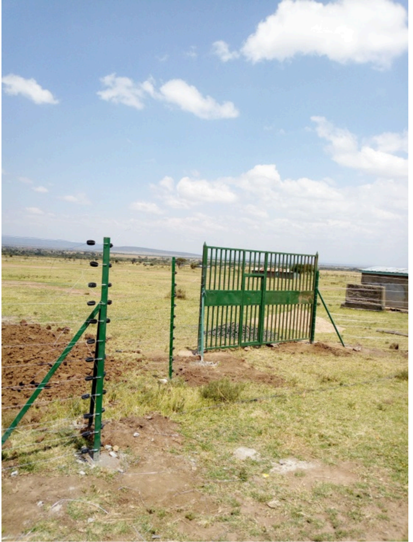
Main gate to get into school yard