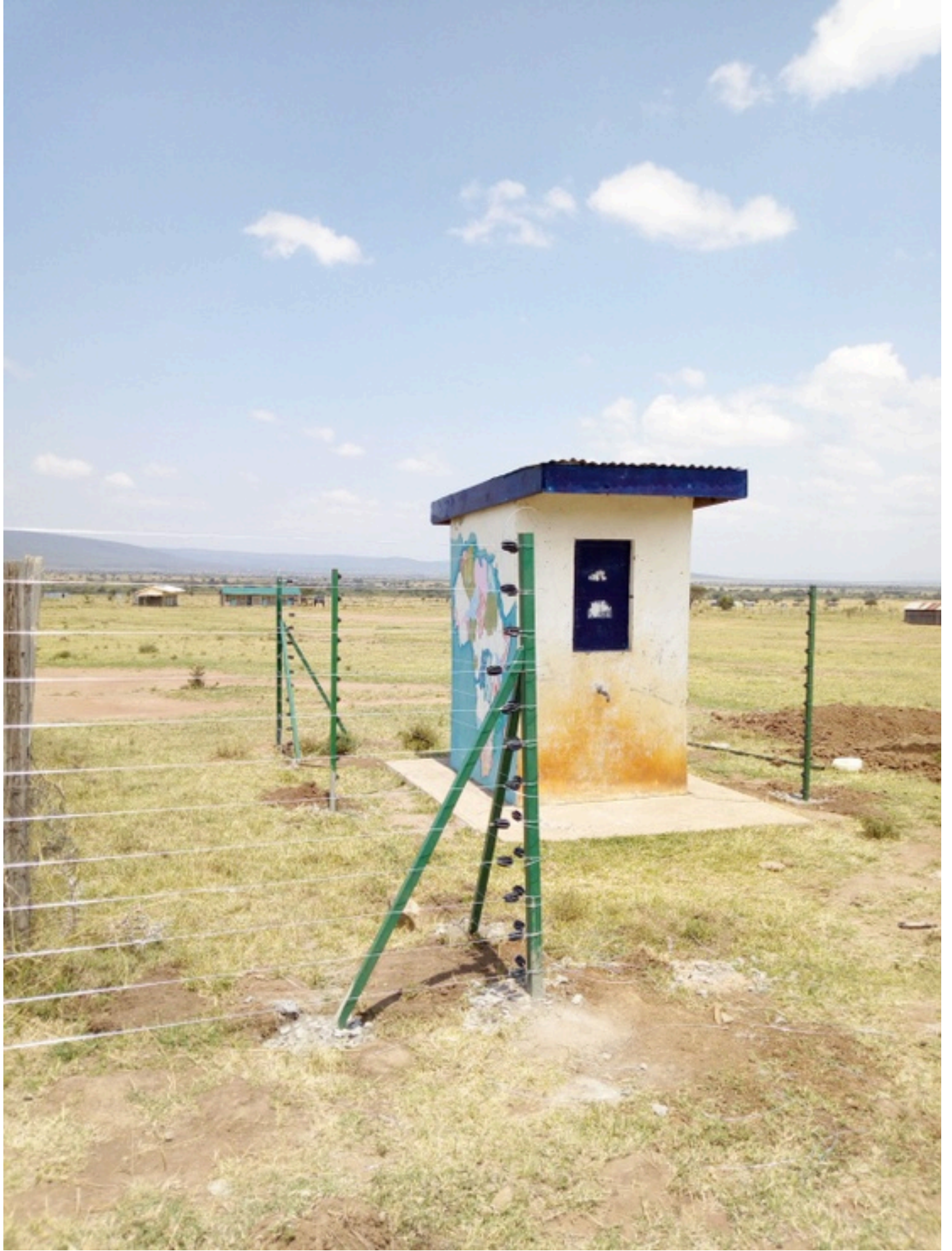
Community Water Point outside the fence