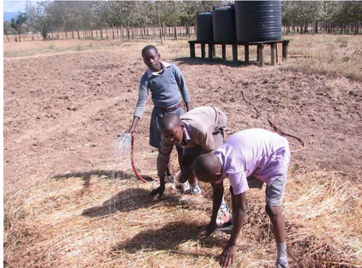
Students watering school garden

We have good news to share with you! The water project for the Burguret Primary School was completed within budget! Visit our KSP web site ( kenyanschoolproject.org ) to view a video of the completed water system and other great photos from the Burguret School. Four tanks in all were purchased and installed along with gutters, a washing station and a small fence. The water is providing improved hygiene and students no longer have to carry water to school for drinking and washing.